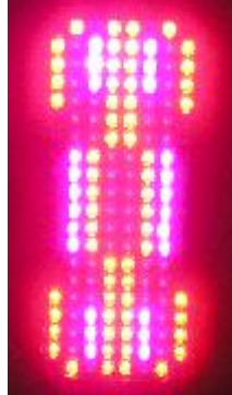
All 136 LEDs